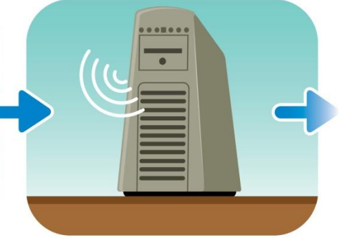
HomMed Monitor securely transfers medical data over network.