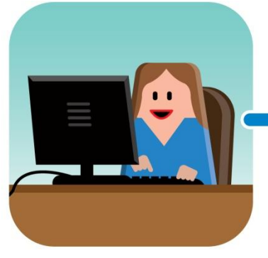
Clinician programs/updates monitor based on patient's condition.