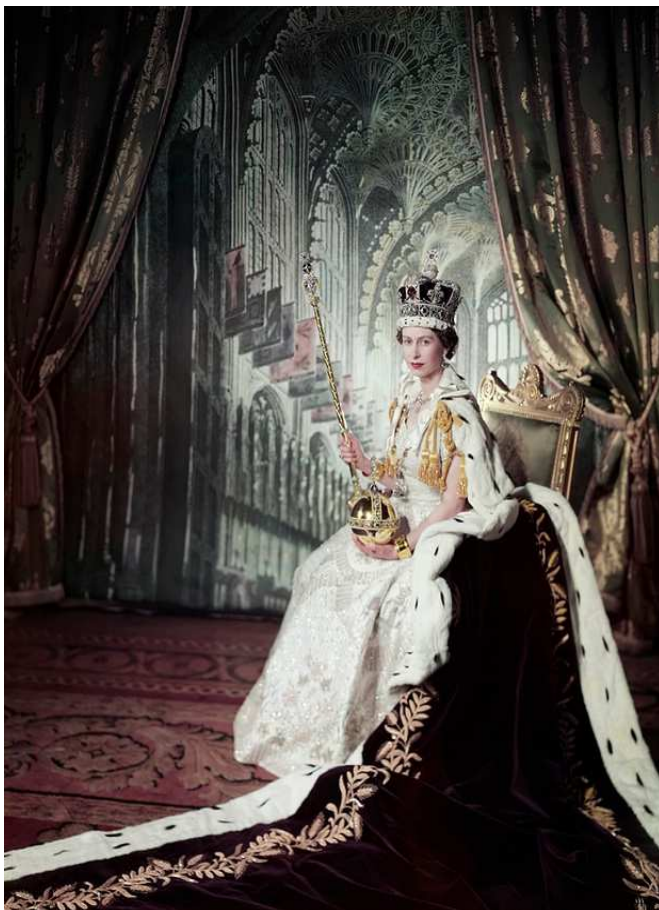
Coronation Day, 2 June 1953